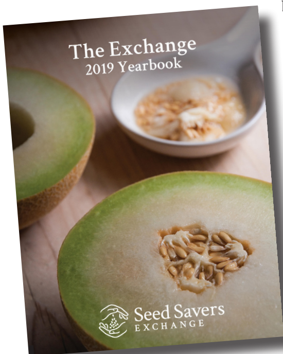
The cover of the 2019 Exchange print Yearbook, which is 504 pages this year. Thank you for your support of seed saving and sharing.

also reaching out to encourage new listers as well. She is talking with farmers and plant breeders about how they use the Exchange, and working to promote the resource as broadly as possible as we look toward fostering and supporting new generations of seed savers.