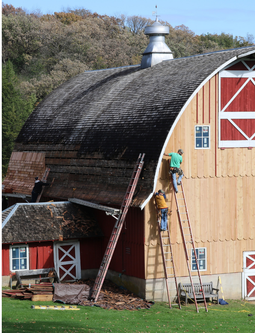
Our historic barn undergoing restoration, thanks to the support of our community.

individuals enjoyed the beautiful and educational display gardens; collected apples in our historic orchards; admired our iconic red barn that houses classes, barn dances, and seed processing; viewed rare heritage livestock breeds; and explored our network of more than eight miles of hiking trails. In addition to our display gardens and orchards, Heritage Farm's 890 acres in the Driftless Region of Northeast Iowa is home to limestone bluffs, spring-fed trout streams, sweeping ridgeline vistas, grass pastures, and prairie and forest areas that draw visitors from near and far.