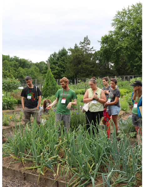
A tour of the Evaluation Garden at Heritage Farm.